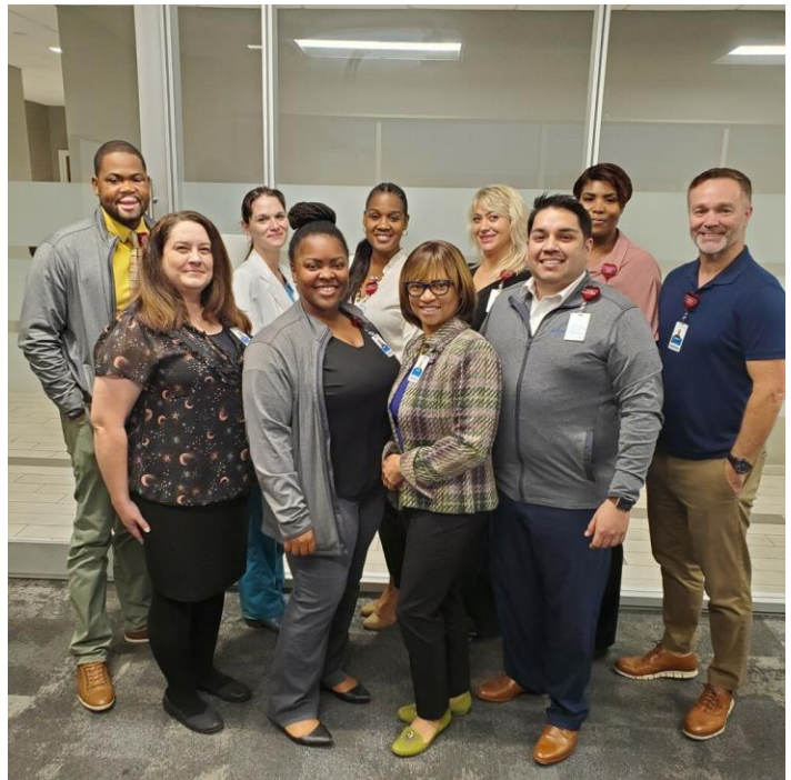
AdventHealth Community Care Team

*Total patients served for Orange, Osceola and Seminole County in 2019